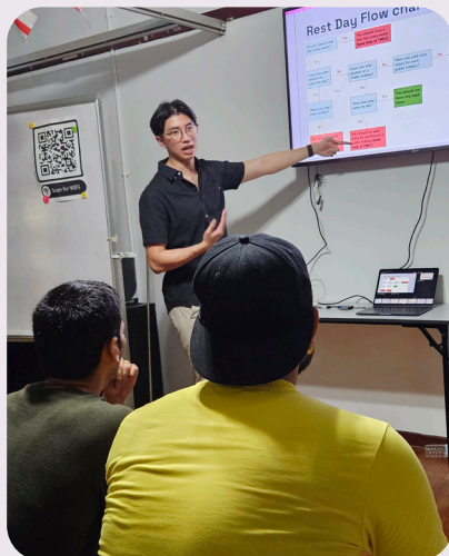
Talk to migrant workers at TWC2