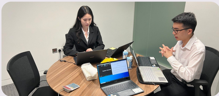
Video conferencing consultations with volunteer lawyers at the PBC Legal Clinic