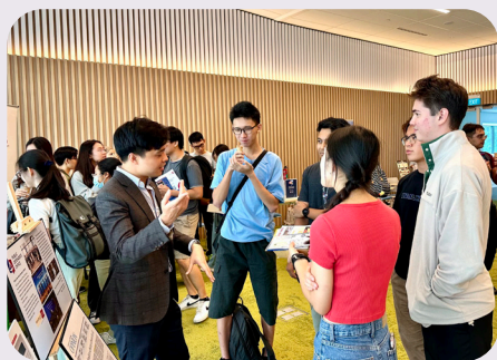
Pro Bono Week 2024