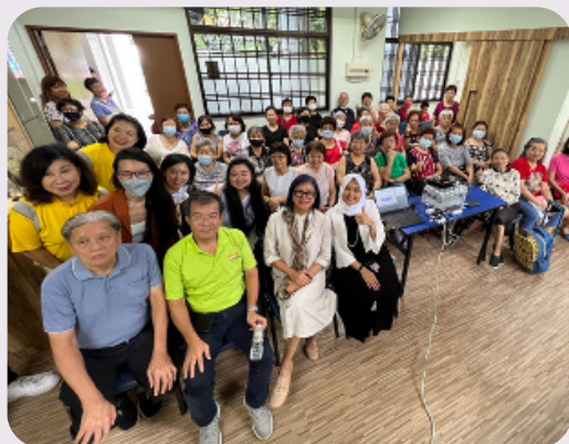
LPA talk at Bukit Batok East Community Club