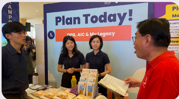
OPG Pre-Planning Campaign to raise awareness of LPA and ACP