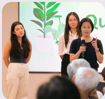
LPA talk at Thomson Shunfu RC