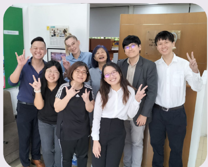
LPA Certification at The Singapore Association For The Deaf