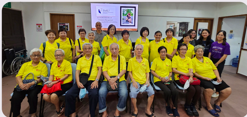
Talk on Advance Care Plan at Xin Yuan Community Care